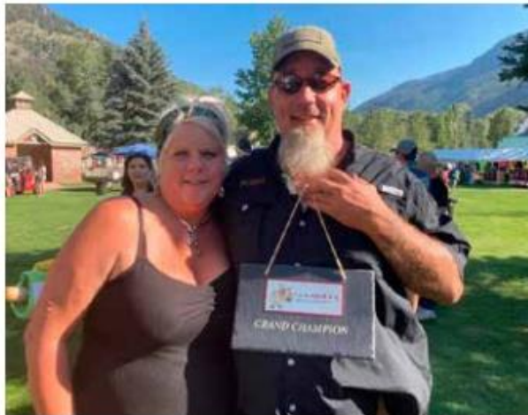
B-S BBQ Outlaws, Grand Champions in Pork Master Series